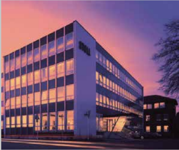
H. Stoll GmbH & Co. KG Headquarter, Reutlingen

up front, and the system is quickly accepted by the users." Right before the switchover, employees were given extensive startup training and thus optimally prepared. The advantages of the new system were easily apparent.